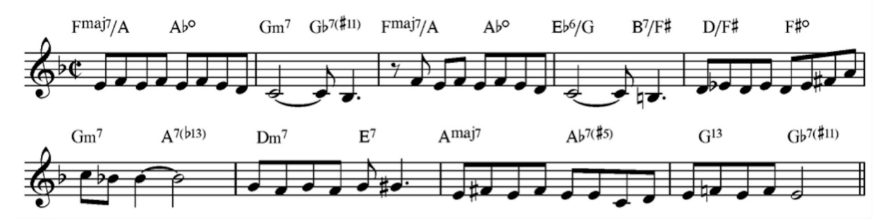
Figure 1: Introdution. "Desafinado" Cancioneiro Jobim.

Jobim: The composer of Desafinado plays (1963), Terra Brasilis (1980), Inédito record 2 (1987), Sinatra/Jobim (1995), Minas Ao Vivo- Piano e Voz (2004) and the recordings Você Ainda Não Ouviu Nada (Philips, 1964) by Sérgio Mendes & Bossa Rio and Ella Abraça Jobim (Pablo Records, 1981) by singer Ella Fitzgerald.