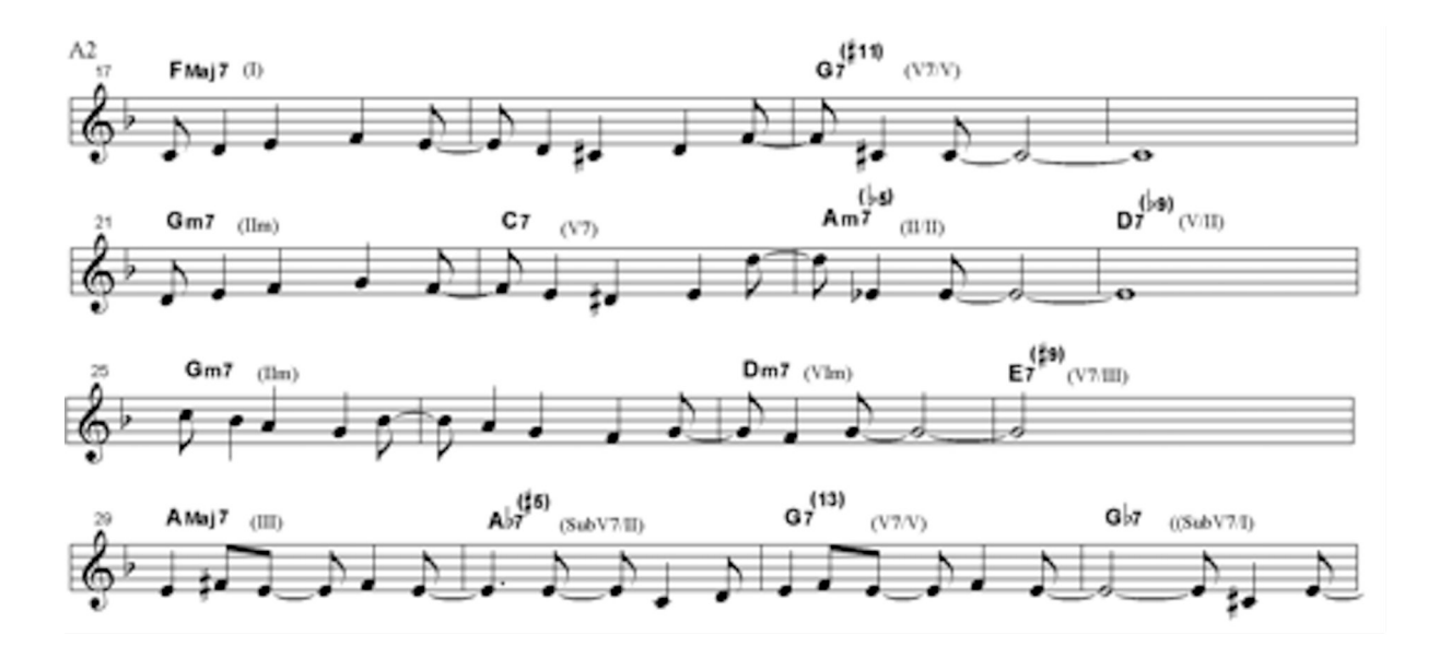
Figure 6: Songbook Tom Jobim, part A2, measures 17-32.

In the exposition of the first theme (A1, measures 1-16), in the last two notes of the melody in measure 6, there is a melodic interval of a descending minor 6th between the notes E and C. This creates, in the melody, the third (the note C) of the A half-diminished chord. In measure 22, the second time in which the melody is presented, there is a modification in the melody. The last note of the measure is the note D, which creates the interval of a descending major seventh, the 11th of the A half-diminished. In the version on Jazz samba , this modification is not present, nor in the books Real Book (manuscript) or The New Real Book . There the written parts possess a repeat sign indicating the same A. Other recordings cited here repeat the Jazz Samba version: the recordings of Sérgio Mendes e Bossa Rio , of Ella Fitzgerald from 1962 ( single ) and the LP Ella Abraça Jobim from 1981. In this excerpt (measures 22-23), the singer Pat Thomas sings according to the original version.