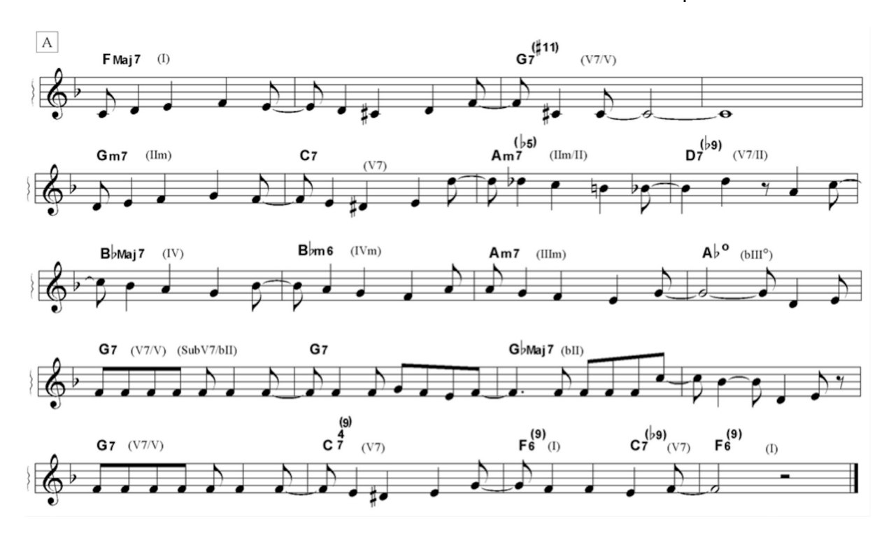
Figure 10: Songbook Tom Jobim, part A3, measures 49-68.

In the A3 section, the original theme returns and the form is finalized with 68 measures. The A3 section has four measures more than the other parts: