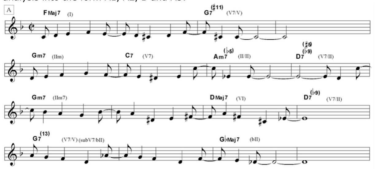
Figure 2: Cancioneiro Jobim, part A1, measures 1-16.

Next, we compare the melodic and harmonic differences that exist between the versions based on the written music in the Songbook Tom Jobim and Cancioneiro Jobim . We consider measure 1 to be the exposition of the theme and divide the analysis into the form A1, A2, B and A3: